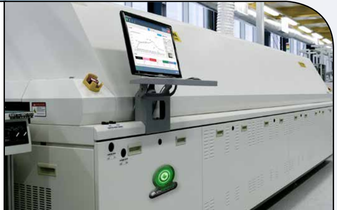
OvenSENTINEL™ Status Indicator Badge